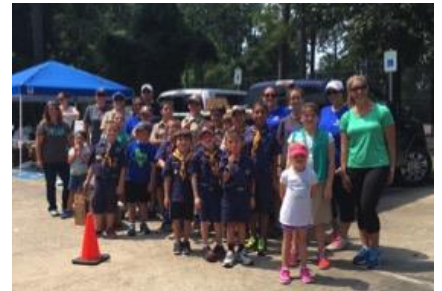
RIGHT - Giving Service to Others: 5K for Parkinson's Disease, Hurricane Harvey Relief