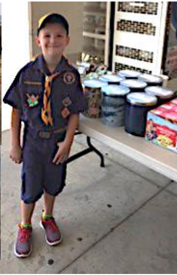
LEFT - Fundraising to Support Scouting: Bags, Mulch and Popcorn