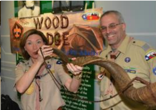
Leadership at University of Scouting