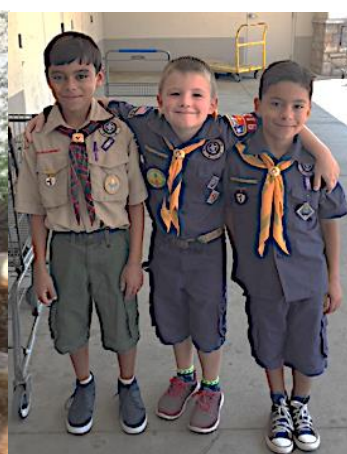
...and HAVING FUN!