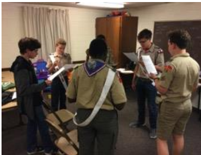
Making Friends, Outdoor Adventures...