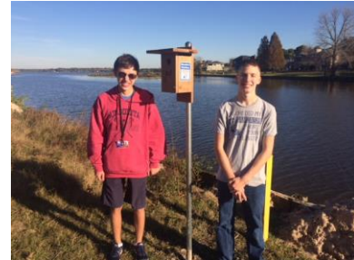
First box: December, 2017

Build nesting boxes along Lake Houston. Test the results.